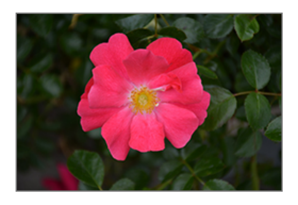
Flower Carpet Pink Supreme Rose flowers

Flower Carpet Pink Supreme Rose will grow to be about 3 feet tall at maturity, with a spread of 3 feet. It tends to fill out right to the ground and therefore doesn't necessarily require facer plants in front. It grows at a fast rate, and under ideal conditions can be expected to live for approximately 30 years.