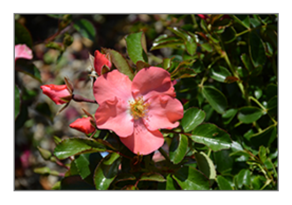
Flower Carpet Pink Supreme Rose flowers

This shrub will require occasional maintenance and upkeep, and is best pruned in late winter once the threat of extreme cold has passed. It is a good choice for attracting bees to your yard. It has no significant negative characteristics.