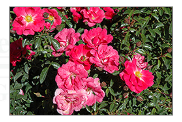
Flower Carpet Pink Supreme Rose flowers