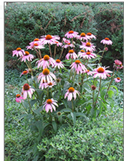
Purple Coneflower in bloom