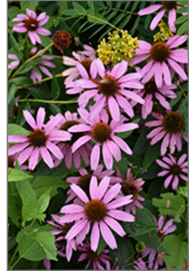
Purple Coneflower flowers

This is a relatively low maintenance plant, and is best cleaned up in early spring before it resumes active growth for the season. It is a good choice for attracting birds and butterflies to your yard, but is not particularly attractive to deer who tend to leave it alone in favor of tastier treats. It has no significant negative characteristics.