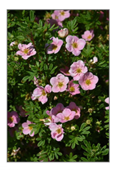
Pink Beauty Potentilla flowers

This is a relatively low maintenance shrub, and is best pruned in late winter once the threat of extreme cold has passed. It is a good choice for attracting butterflies to your yard, but is not particularly attractive to deer who tend to leave it alone in favor of tastier treats. It has no significant negative characteristics.