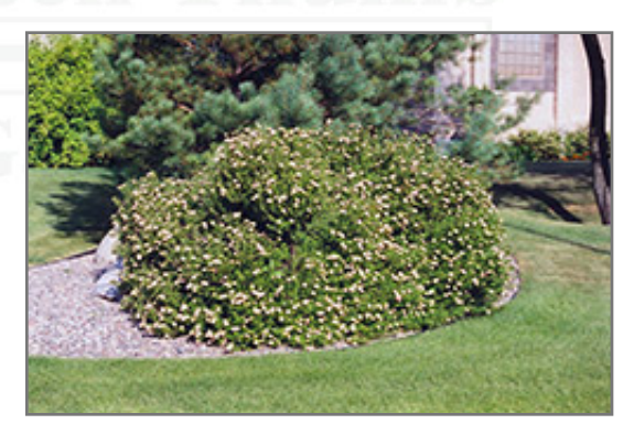
Pink Beauty Potentilla in bloom

Pink Beauty Potentilla is recommended for the following landscape applications;