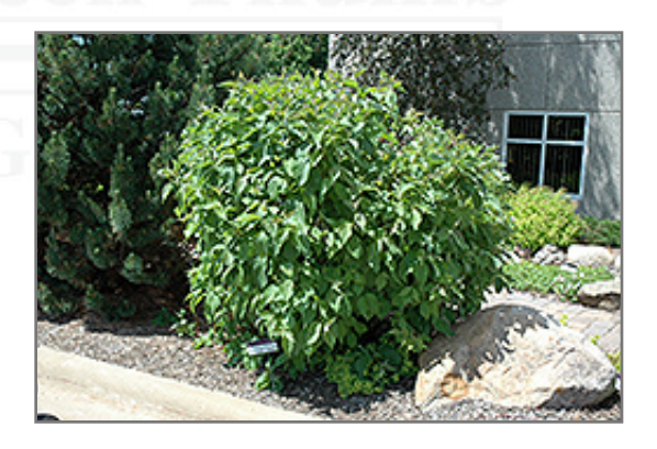
Baton Rouge Dogwood

Baton Rouge Dogwood is recommended for the following landscape applications;