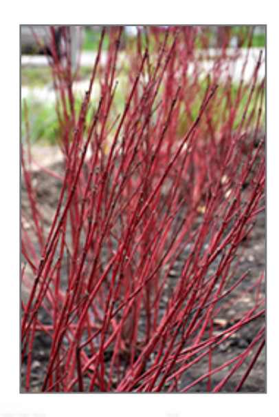
Baton Rouge Dogwood stems

This is a relatively low maintenance shrub, and can be pruned at anytime. It has no significant negative characteristics.