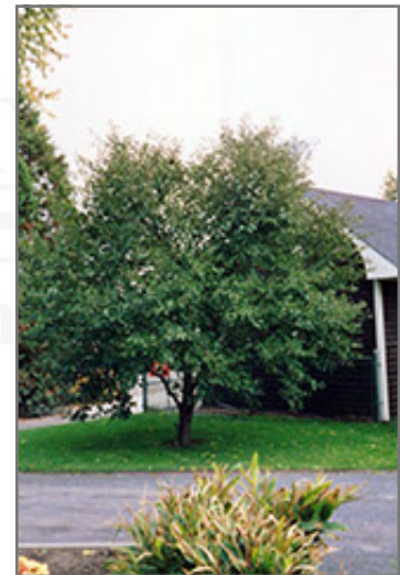
Montmorency Cherry