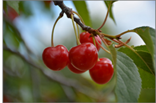
Montmorency Cherry fruit