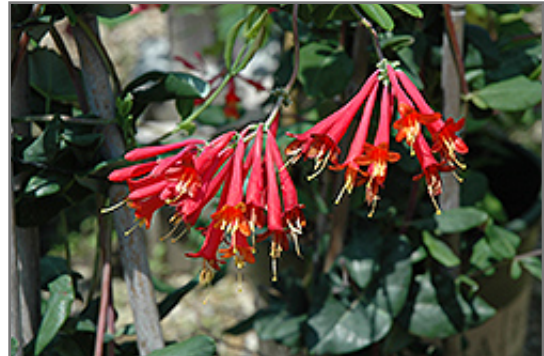
Major Wheeler Coral Honeysuckle flowers

This woody vine will require occasional maintenance and upkeep, and is best pruned in late winter once the threat of extreme cold has passed. It is a good choice for attracting butterflies and hummingbirds to your yard. It has no significant negative characteristics.