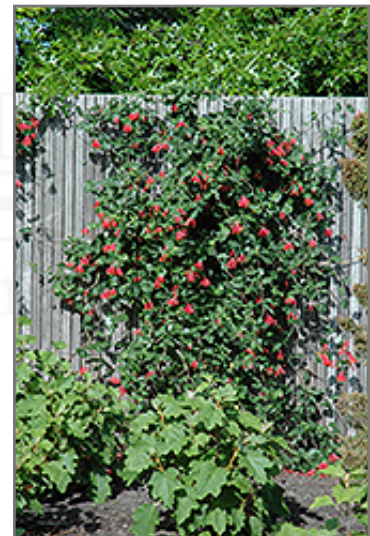
Major Wheeler Coral Honeysuckle in bloom