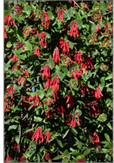
Major Wheeler Coral Honeysuckle flowers

This woody vine should only be grown in full sunlight. It does best in average to evenly moist conditions, but will not tolerate standing water. It is not particular as to soil type or pH. It is somewhat tolerant of urban pollution. Consider applying a thick mulch around the root zone in winter to protect it in exposed locations or colder microclimates. This is a selection of a native North American species.