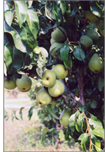
Anjou Pear fruit

Anjou Pear is bathed in stunning clusters of white flowers with purple anthers along the branches in early spring. It has forest green deciduous foliage. The glossy pointy leaves turn an outstanding deep purple in the fall. The fruits are showy green pears with a red blush, which are carried in abundance in early fall. The fruit can be messy if allowed to drop on the lawn or walkways, and may require occasional clean-up.