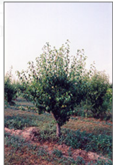
Anjou Pear