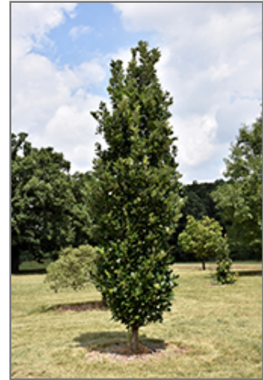
Regal Prince English Oak