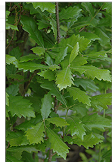
Regal Prince English Oak foliage