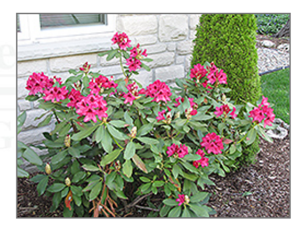
Nova Zembla Rhododendron in bloom

Nova Zembla Rhododendron is recommended for the following landscape applications;