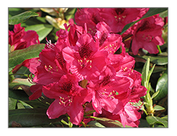
Nova Zembla Rhododendron flowers

This is a relatively low maintenance shrub, and should only be pruned after flowering to avoid removing any of the current season's flowers. It has no significant negative characteristics.