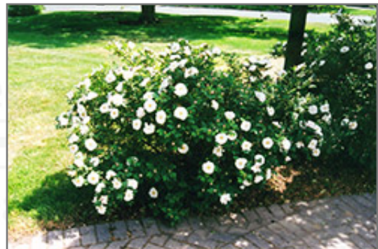
Henry Hudson Rose in bloom