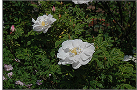
Henry Hudson Rose flowers

This is a high maintenance shrub that will require regular care and upkeep, and is best pruned in late winter once the threat of extreme cold has passed. Gardeners should be aware of the following characteristic(s) that may warrant special consideration;