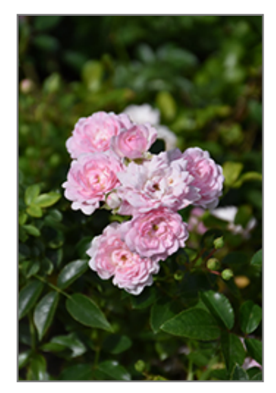
The Fairy Rose flowers

A popular old-fashioned shrub rose, featuring clusters of double light pink flowers all season long; compact and very low-growing, hardy and resistant to disease, makes an excellent flowering groundcover; all roses need full sun and well-drained soil