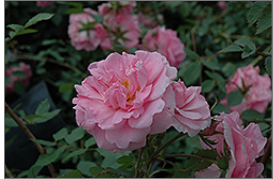
John Davis Rose flowers