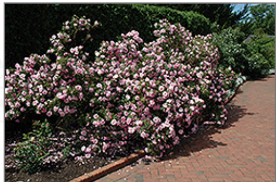
John Davis Rose in bloom