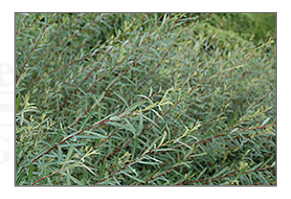
Dwarf Arctic Willow foliage

This shrub will require occasional maintenance and upkeep, and is best pruned in late winter once the threat of extreme cold has passed. It has no significant negative characteristics.