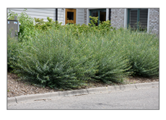
Dwarf Arctic Willow

Dwarf Arctic Willow is a multi-stemmed deciduous shrub with a more or less rounded form. Its relatively fine texture sets it apart from other landscape plants with less refined foliage.