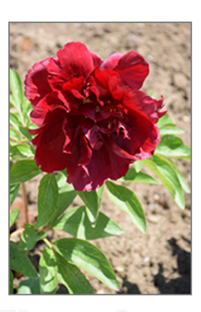
Henry Bockstoce Peony flowers

Henry Bockstoce Peony features bold fragrant red flowers at the ends of the stems from late spring to early summer. The flowers are excellent for cutting. Its compound leaves remain green in colour throughout the season.