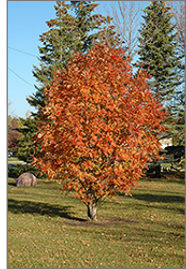
Cardinal Royal Mountain Ash in fall

This is a relatively low maintenance tree, and usually looks its best without pruning, although it will tolerate pruning. It is a good choice for attracting birds to your yard. Gardeners should be aware of the following characteristic(s) that may warrant special consideration;