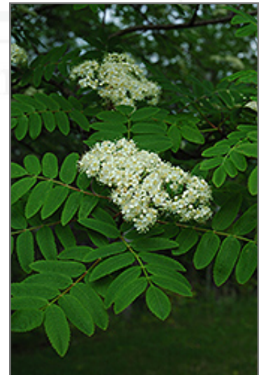
Cardinal Royal Mountain Ash flowers