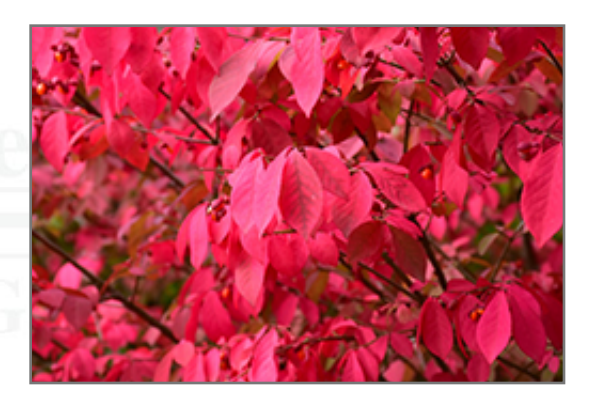
Winged Burning Bush in fall