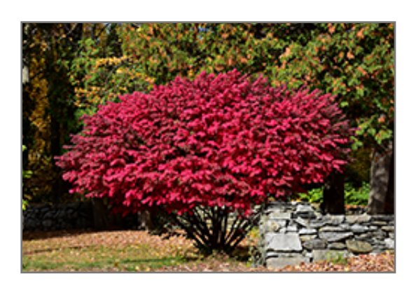
Winged Burning Bush in fall

This is a relatively low maintenance shrub, and can be pruned at anytime. It has no significant negative characteristics.