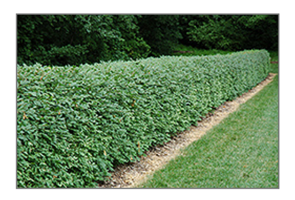
Winged Burning Bush

Winged Burning Bush will grow to be about 10 feet tall at maturity, with a spread of 10 feet. It tends to fill out right to the ground and therefore doesn't necessarily require facer plants in front, and is suitable for planting under power lines. It grows at a slow rate, and under ideal conditions can be expected to live for 50 years or more.