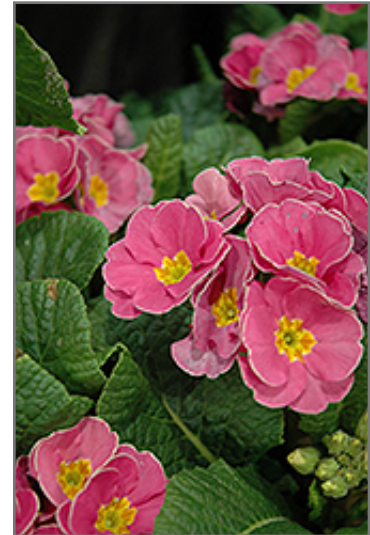
Supernova Pink Primrose flowers

This variety features lovely clusters of pink blooms with yellow centers and white edges, above deep green foliage for wonderful contrast; a colorful display in a border or container planting