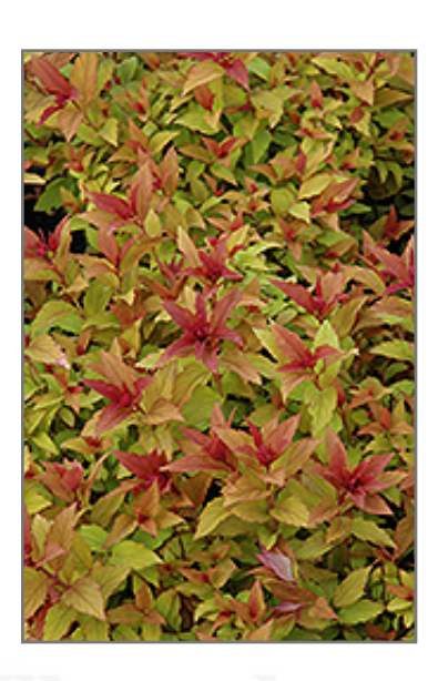
Goldflame Spirea foliage

Goldflame Spirea is a multi-stemmed deciduous shrub with a more or less rounded form. Its relatively fine texture sets it apart from other landscape plants with less refined foliage.