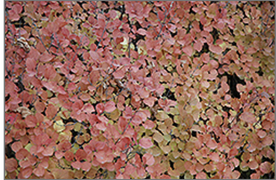
Dwarf Korean Lilac in fall

This shrub should only be grown in full sunlight. It is very adaptable to both dry and moist locations, and should do just fine under average home landscape conditions. It is not particular as to soil type or pH. It is highly tolerant of urban pollution and will even thrive in inner city environments. This is a selected variety of a species not originally from North America.