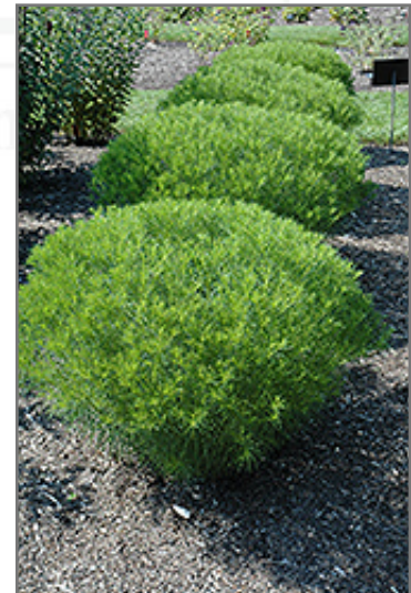
Narrowleaf Ironweed