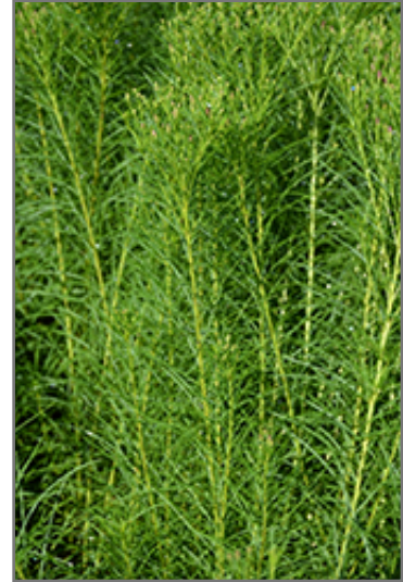
Narrowleaf Ironweed foliage

Narrowleaf Ironweed is recommended for the following landscape applications;