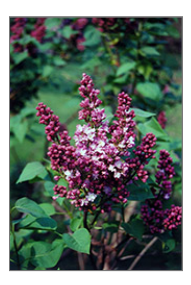
Belle de Nancy Lilac flowers

A stunning spring blooming lilac featuring intensely fragrant double pink flowers in upright panicles; upright, multi-stemmed habit, very hardy, tends to sucker, ideal for screening; full sun and well-drained soil, allow room for air movement