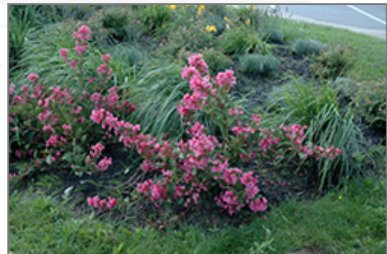
Sonic Bloom Pink Reblooming Weigela in bloom