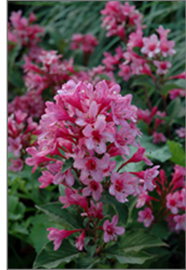
Sonic Bloom Pink Reblooming Weigela flowers

This shrub will require occasional maintenance and upkeep, and should only be pruned after flowering to avoid removing any of the current season's flowers. It is a good choice for attracting hummingbirds to your yard. It has no significant negative characteristics.