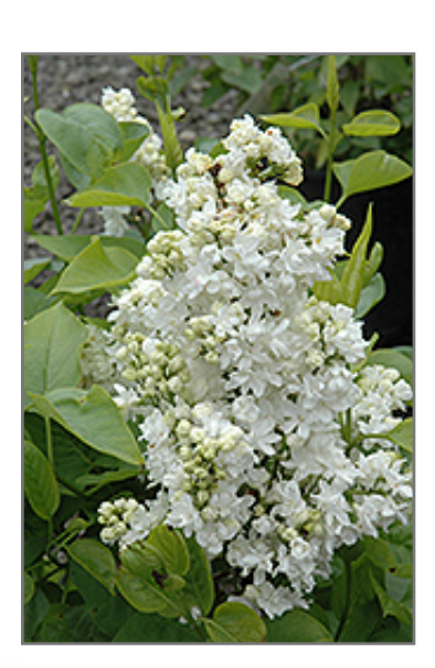
Mme. Lemoine Lilac flowers

One of the classics, this spring blooming lilac features double white flowers with the sweetest perfume in upright panicles; upright, multi-stemmed habit, tends to sucker, ideal for screening; full sun and well-drained soil, allow room for air movement