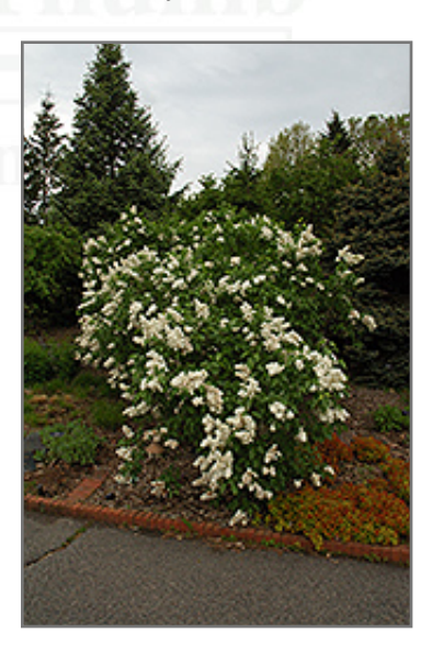
Mme. Lemoine Lilac in bloom

This is a high maintenance shrub that will require regular care and upkeep, and should only be pruned after flowering to avoid removing any of the current season's flowers. It is a good choice for attracting butterflies to your yard, but is not particularly attractive to deer who tend to leave it alone in favor of tastier treats. Gardeners should be aware of the following characteristic(s) that may warrant special consideration;