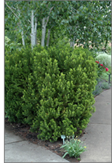
Hicks Yew

Hicks Yew is recommended for the following landscape applications;