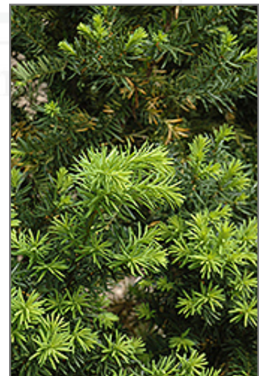
Hicks Yew foliage