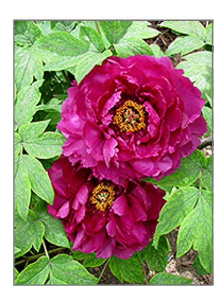
Shimadaijin Tree Peony flowers

Shimadaijin Tree Peony is a multi-stemmed deciduous shrub with an upright spreading habit of growth. Its relatively fine texture sets it apart from other landscape plants with less refined foliage.