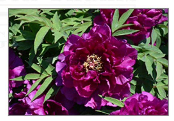
Shimadaijin Tree Peony flowers