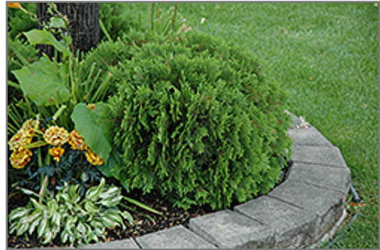
Danica Arborvitae