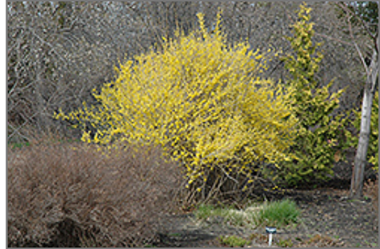
Northern Gold Forsythia in bloom

Northern Gold Forsythia is a multi-stemmed deciduous shrub with an upright spreading habit of growth. Its average texture blends into the landscape, but can be balanced by one or two finer or coarser trees or shrubs for an effective composition.