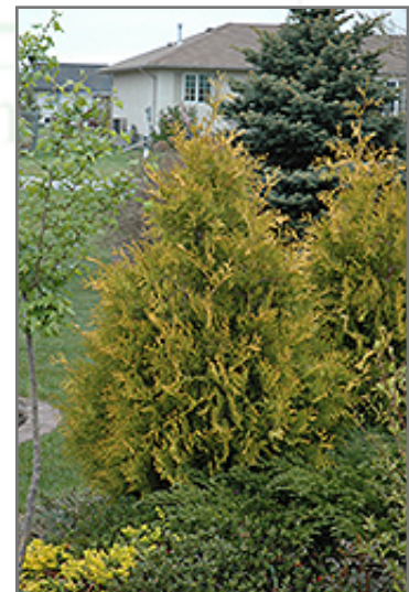
Yellow Ribbon Arborvitae