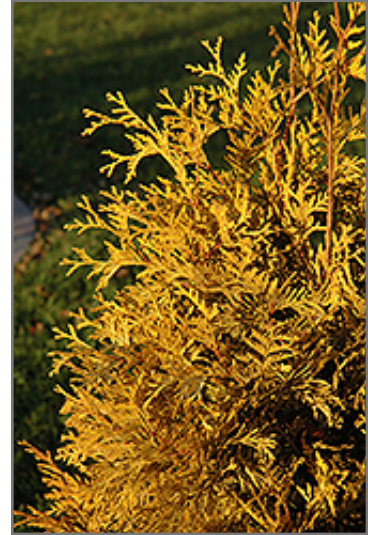
Yellow Ribbon Arborvitae in fall

This shrub does best in full sun to partial shade. It prefers to grow in average to moist conditions, and shouldn't be allowed to dry out. It is not particular as to soil type or pH. It is somewhat tolerant of urban pollution, and will benefit from being planted in a relatively sheltered location. Consider applying a thick mulch around the root zone in winter to protect it in exposed locations or colder microclimates. This is a selection of a native North American species.