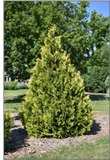
Yellow Ribbon Arborvitae