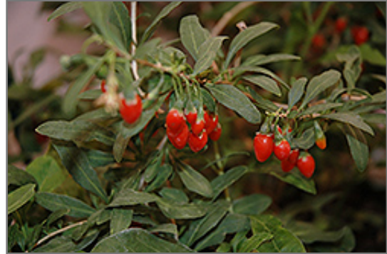
Big Lifeberry Goji Berry fruit

This is a dense multi-stemmed deciduous shrub with an upright spreading habit of growth. Its relatively fine texture sets it apart from other landscape plants with less refined foliage. This plant will require occasional maintenance and upkeep, and is best pruned in late winter once the threat of extreme cold has passed. It has no significant negative characteristics.