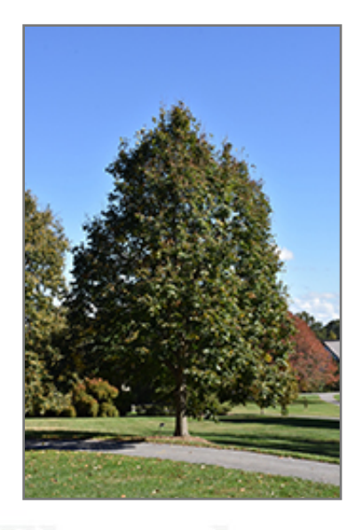
Redmond Linden

This is a relatively low maintenance tree, and is best pruned in late winter once the threat of extreme cold has passed. It is a good choice for attracting bees to your yard. Gardeners should be aware of the following characteristic(s) that may warrant special consideration;