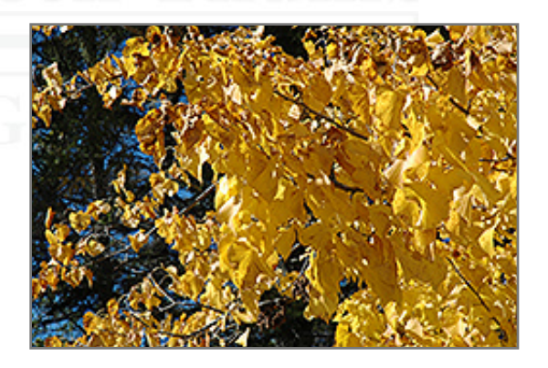
Redmond Linden in fall