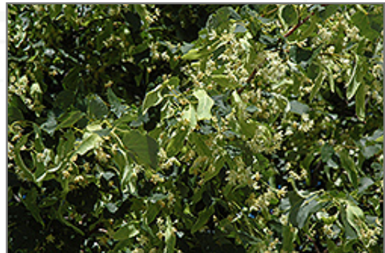
Greenspire Linden flowers