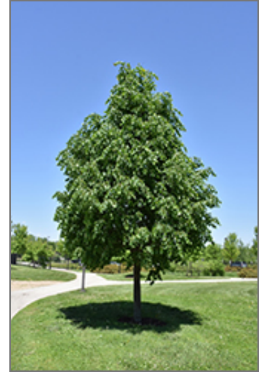
Greenspire Linden

Greenspire Linden is a dense deciduous tree with a strong central leader and a distinctive and refined pyramidal form. Its average texture blends into the landscape, but can be balanced by one or two finer or coarser trees or shrubs for an effective composition.