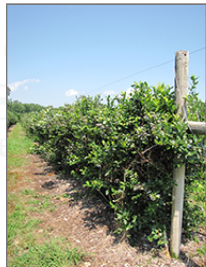
Patriot Blueberry fruit