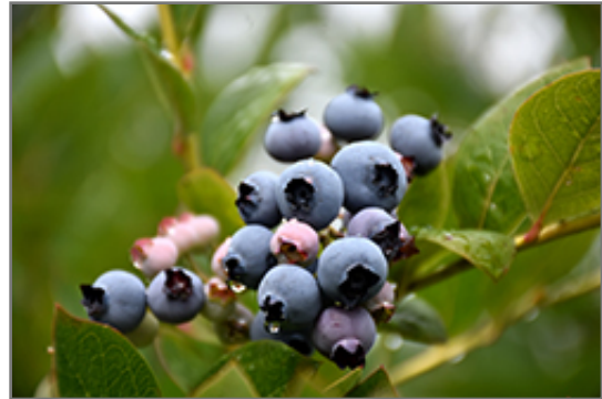
Patriot Blueberry fruit