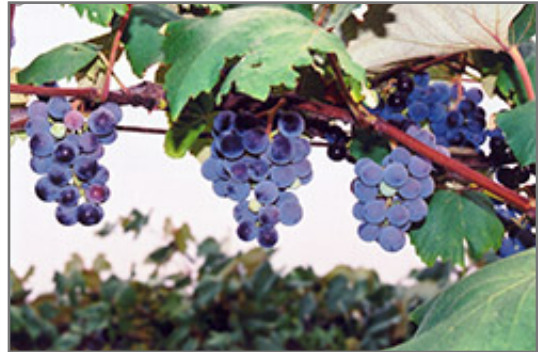
Concord Grape fruit

Concord Grape has rich green deciduous foliage on a plant with a spreading habit of growth. The lobed leaves turn yellow in fall. It produces abundant clusters of deep purple grapes with blue overtones from early to late fall.