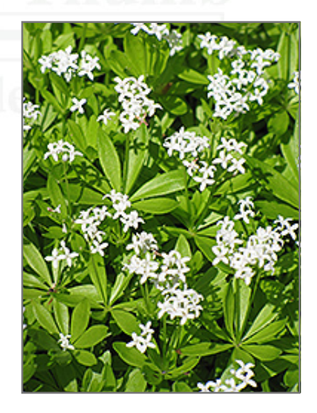
Sweet Woodruff flowers