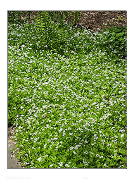
Sweet Woodruff in bloom

Sweet Woodruff is recommended for the following landscape applications;