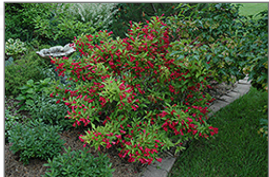
Red Prince Weigela in bloom