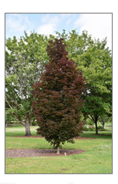
Crimson Sentry Norway Maple

Crimson Sentry Norway Maple is primarily valued in the landscape for its distinctively pyramidal habit of growth. It is clothed in stunning corymbs of lemon yellow flowers along the branches in early spring before the leaves. It has attractive burgundy deciduous foliage. The lobed leaves are highly ornamental and turn an outstanding deep purple in the fall.