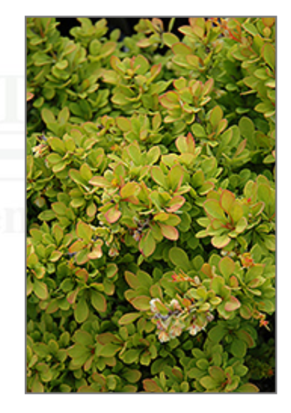
Sunsation Japanese Barberry foliage