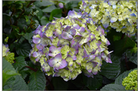
Bloomstruck Hydrangea flowers

Bloomstruck Hydrangea will grow to be about 4 feet tall at maturity, with a spread of 5 feet. It tends to fill out right to the ground and therefore doesn't necessarily require facer plants in front. It grows at a fast rate, and under ideal conditions can be expected to live for approximately 20 years.