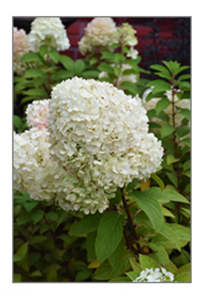
Bobo Hydrangea flowers

Bobo Hydrangea is recommended for the following landscape applications;