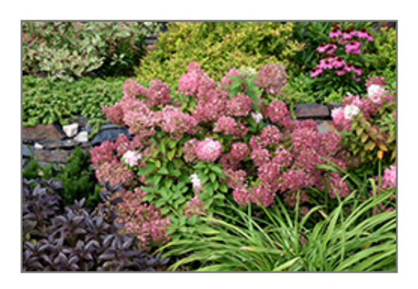
Bobo Hydrangea in bloom

This shrub performs well in both full sun and full shade. It prefers to grow in average to moist conditions, and shouldn't be allowed to dry out. It is not particular as to soil type or pH. It is highly tolerant of urban pollution and will even thrive in inner city environments. Consider applying a thick mulch around the root zone in winter to protect it in exposed locations or colder microclimates. This is a selected variety of a species not originally from North America.