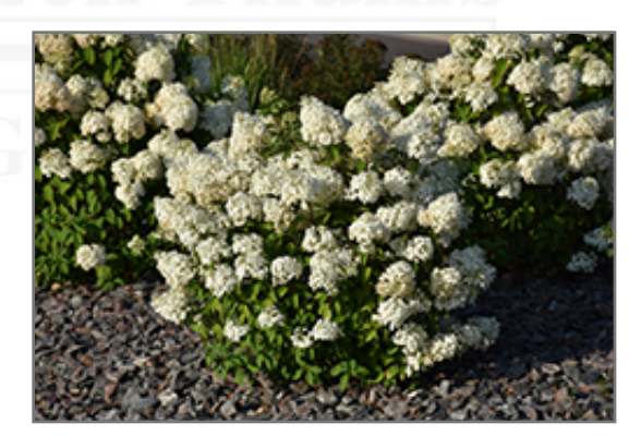
Bobo Hydrangea in bloom