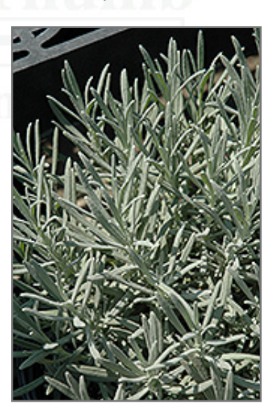
Phenomenal Lavender foliage

This is a relatively low maintenance shrub, and can be pruned at anytime. It is a good choice for attracting butterflies to your yard, but is not particularly attractive to deer who tend to leave it alone in favor of tastier treats. It has no significant negative characteristics.