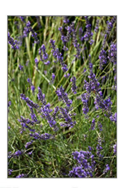
Phenomenal Lavender flowers

Striking bluish-purple blooms covering slightly taller stems sets this very hardy cultivar apart; impressive silvery foliage is beautifully fragrant; excellent for borders, containers, and massing in the garden; used for sachets and perfumes