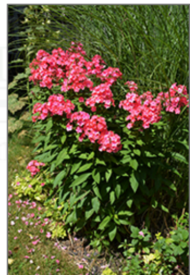
Flame Coral Garden Phlox in bloom