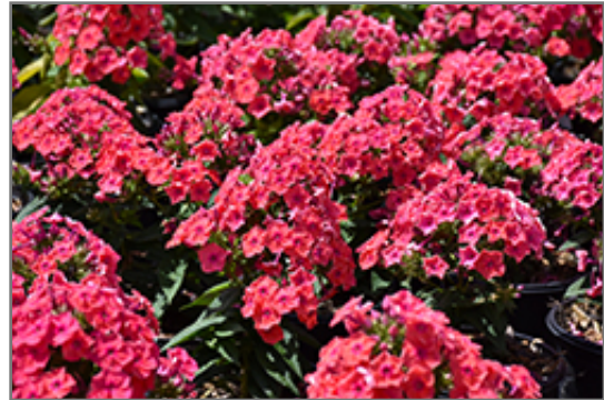
Flame Coral Garden Phlox flowers