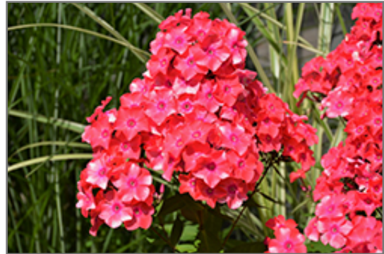
Flame Coral Garden Phlox flowers

Flame Coral Garden Phlox is a dense herbaceous perennial with an upright spreading habit of growth. Its medium texture blends into the garden, but can always be balanced by a couple of finer or coarser plants for an effective composition.