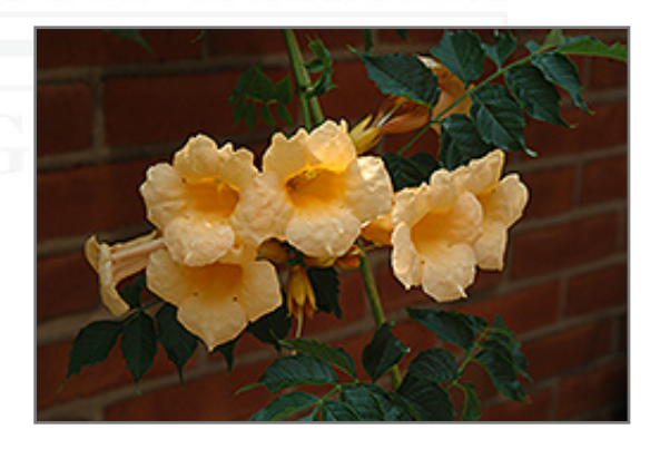
Yellow Trumpetvine flowers