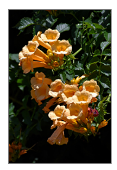
Yellow Trumpetvine flowers

Yellow Trumpetvine is a dense multi-stemmed deciduous woody vine with a twining and trailing habit of growth. Its average texture blends into the landscape, but can be balanced by one or two finer or coarser trees or shrubs for an effective composition.