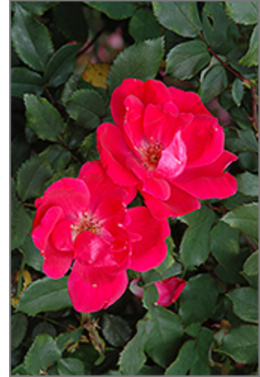
Red Knock Out Rose flowers

Red Knock Out Rose is recommended for the following landscape applications;