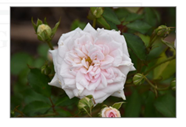
White Drift Rose flowers