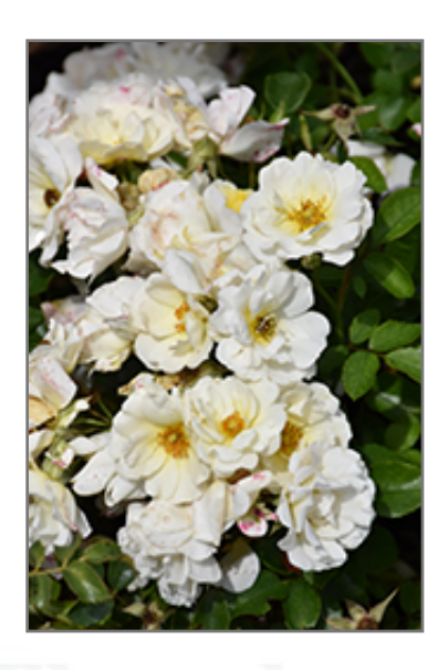
White Drift Rose flowers

This shrub will require occasional maintenance and upkeep, and is best pruned in late winter once the threat of extreme cold has passed. It is a good choice for attracting bees to your yard. It has no significant negative characteristics.