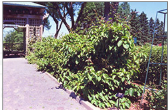
Issai Hardy Kiwi