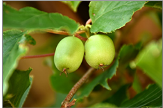
Issai Hardy Kiwi fruit

This is a dense multi-stemmed deciduous woody vine with a spreading, ground-hugging habit of growth. Its relatively coarse texture can be used to stand it apart from other landscape plants with finer foliage. This is a relatively low maintenance plant, and is best pruned in late winter once the threat of extreme cold has passed. It has no significant negative characteristics.