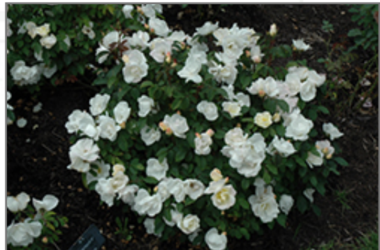
White Knock Out Rose in bloom