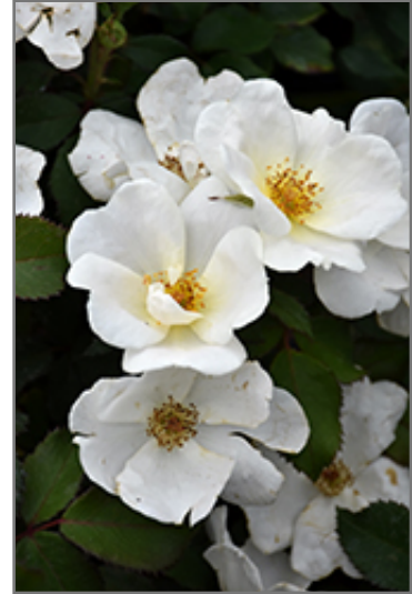
White Knock Out Rose flowers

This shrub will require occasional maintenance and upkeep, and is best pruned in late winter once the threat of extreme cold has passed. Gardeners should be aware of the following characteristic(s) that may warrant special consideration;