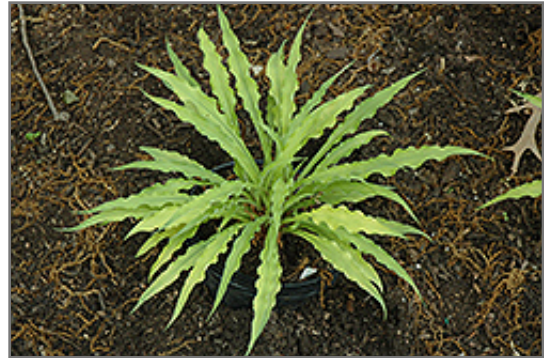
Curly Fries Hosta

Curly Fries Hosta is recommended for the following landscape applications;