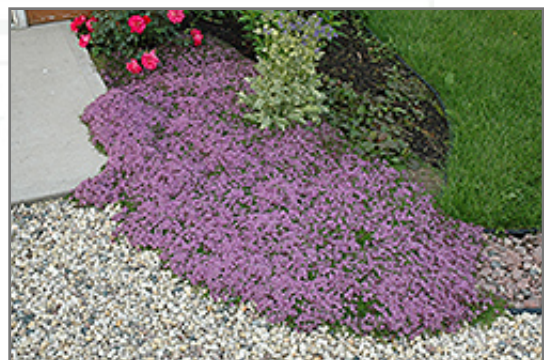
Red Creeping Thyme in bloom