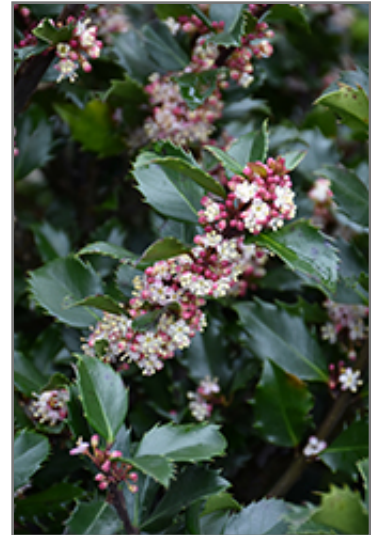
Blue Prince Meserve Holly flowers

Blue Prince Meserve Holly is recommended for the following landscape applications;