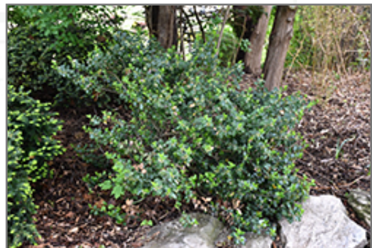
Blue Prince Meserve Holly