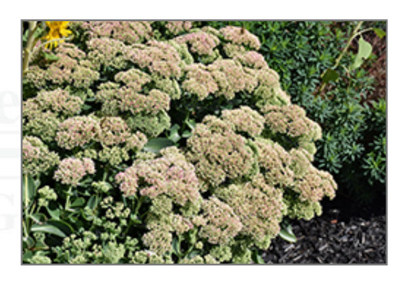
Autumn Joy Stonecrop in bloom