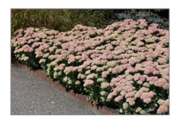
Autumn Joy Stonecrop in bloom

Autumn Joy Stonecrop has masses of beautiful clusters of pink flowers at the ends of the stems from late summer to late fall, which emerge from distinctive coral-pink flower buds, and which are most effective when planted in groupings. The flowers are excellent for cutting. Its large succulent round leaves remain grayish green in colour throughout the season.